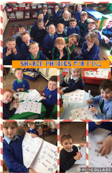
SHARED PHONICS FOR P1&2

Our Linguistic Phonics programme is continuing to benefit both ourselves and Desertmartin PS. Through the sharing of resources, we are able to teach phonics to our children in single year groups which has many benefits. The children enjoy the interaction and practical nature of the activities.