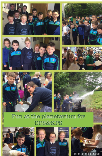
Fun at the planetarium for DPS&KPS

We had a fantastic whole school trip to the Planetarium in Armagh with our friends from Desertmartin PS recently. All our classes completed a topic on 'Space' this year, so the trip was an excellent way to consolidate what we know and explore new things. We all got to design and launch our own rocket!